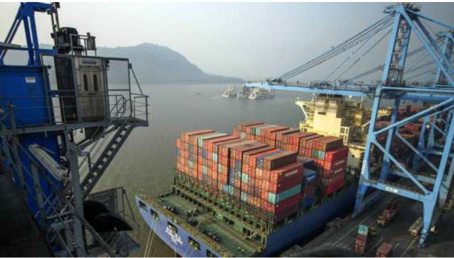
TRADE ASSET. This is seen as a strategic move to ensure that IPGL gets 'experience' in running port building and maintenance operations

At the centre is Bharat Global Ports, a newly formed state-owned consortium unveiled in February by Minister of Ports, Shipping and Waterways Sarbananda Sonowal. There is a comprehensive plan of end-to-end port infrastructure solutions — from terminal operations